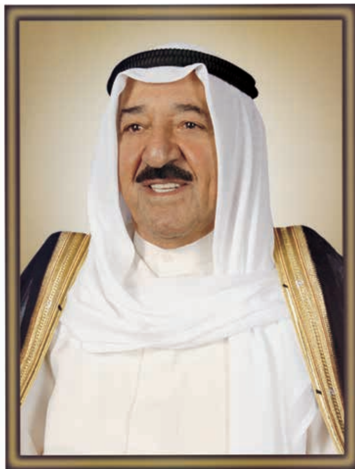
H.H. Sheikh Sabah Al-Ahmad Al-Jaber Al-Sabah The Amir of the State of Kuwait