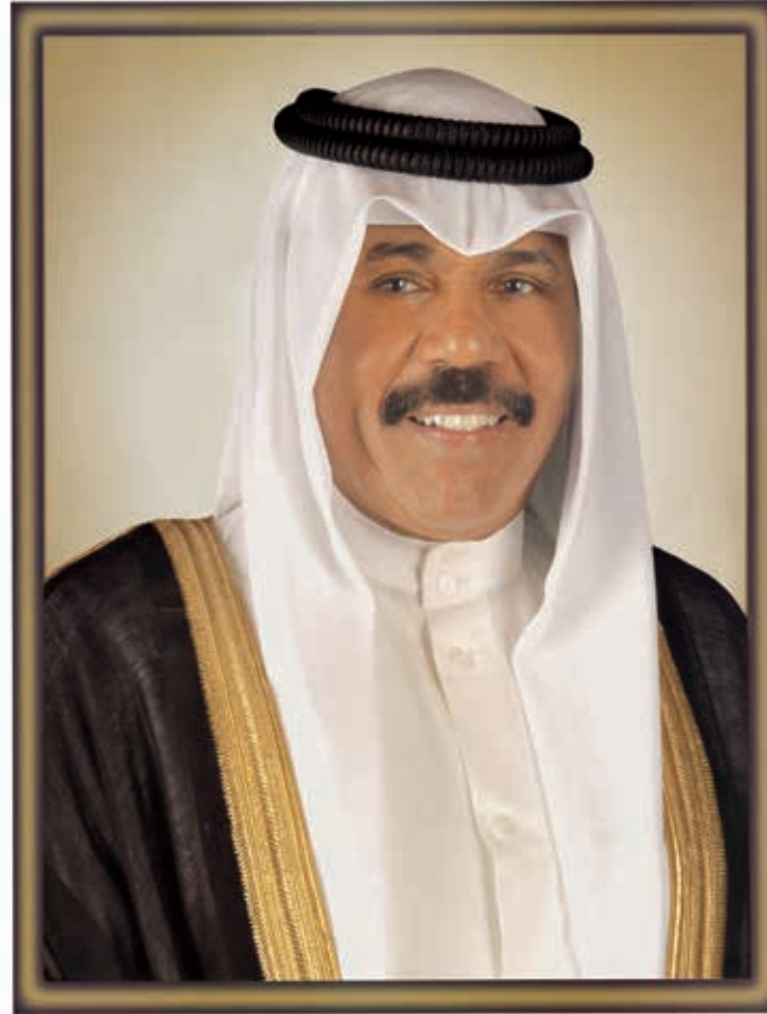
H.H. Sheikh Nawwaf Al-Ahmad Al-Jaber Al-Sabah The Crown Prince of the State of Kuwait